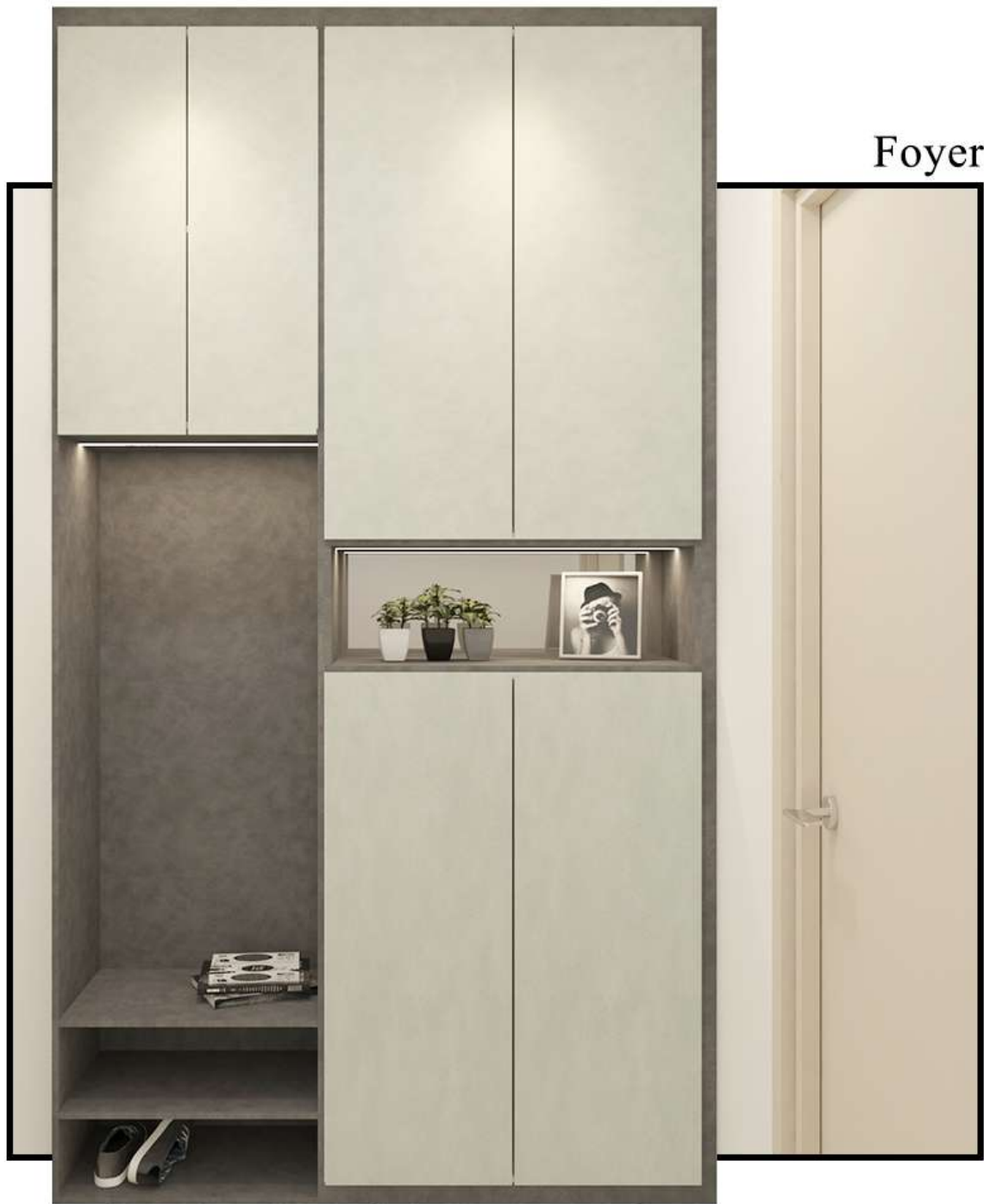
5' full height Shoe Cabinet design